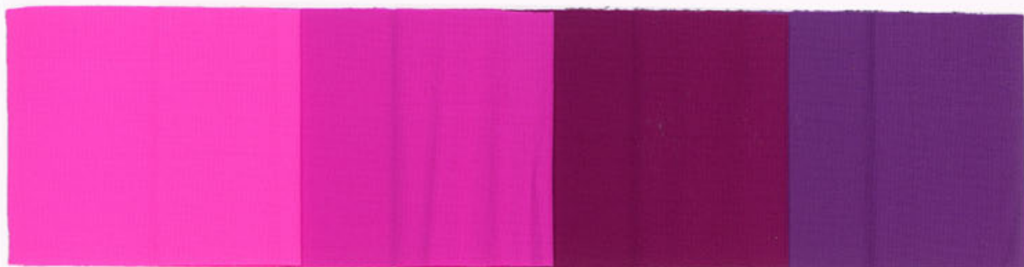
M 155 - WILD PINK*