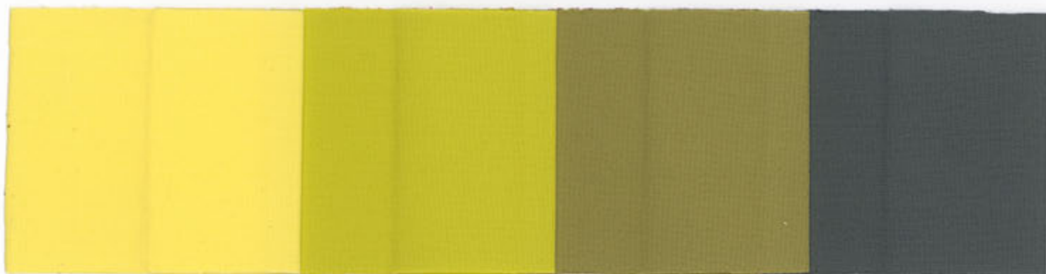
M 160 - LEVANTE Stock Service