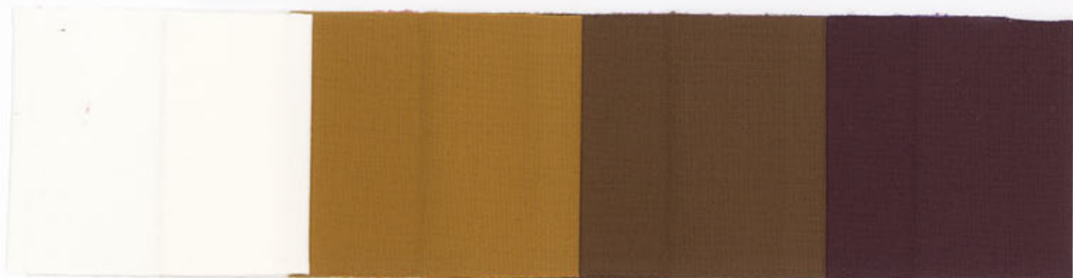
03 - PANNA Stock Service