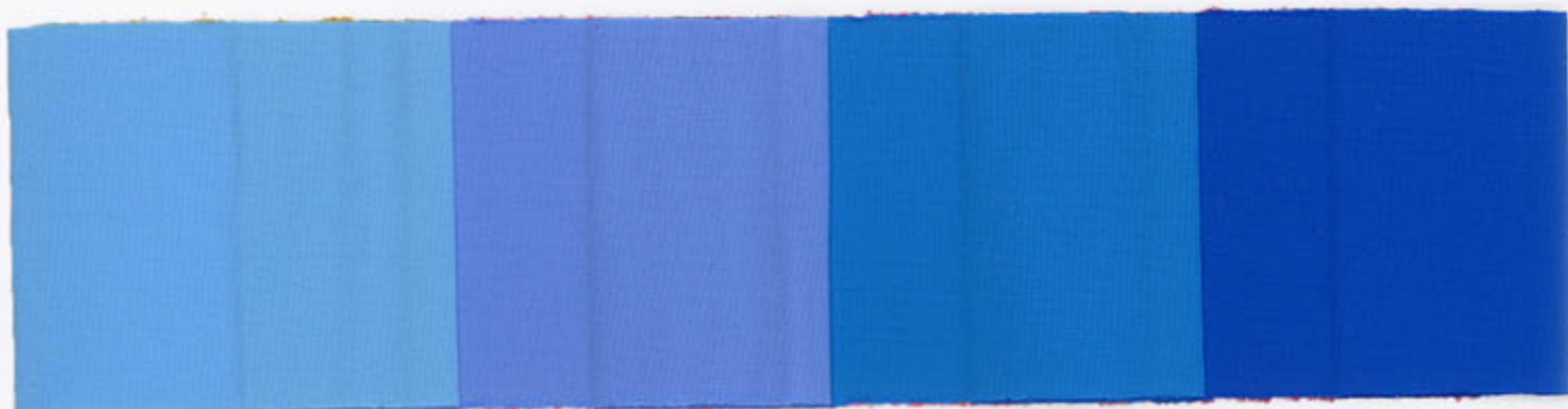
C 041 - PRINCE Stock Service