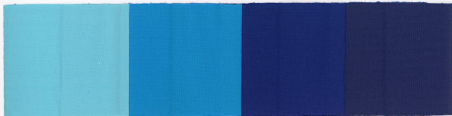
C 035 - HOLIDAY Stock Service