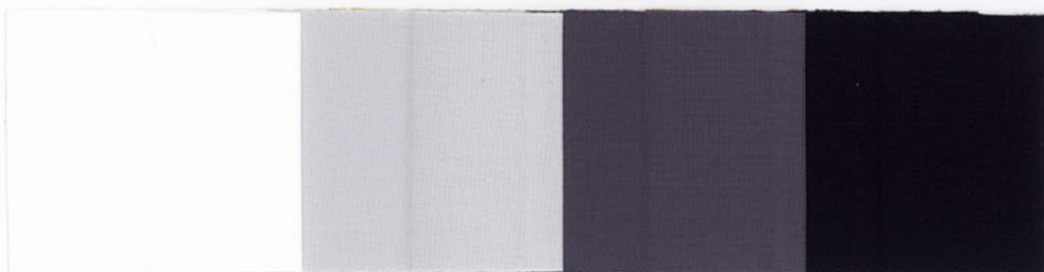
01 - BIANCO Stock Service