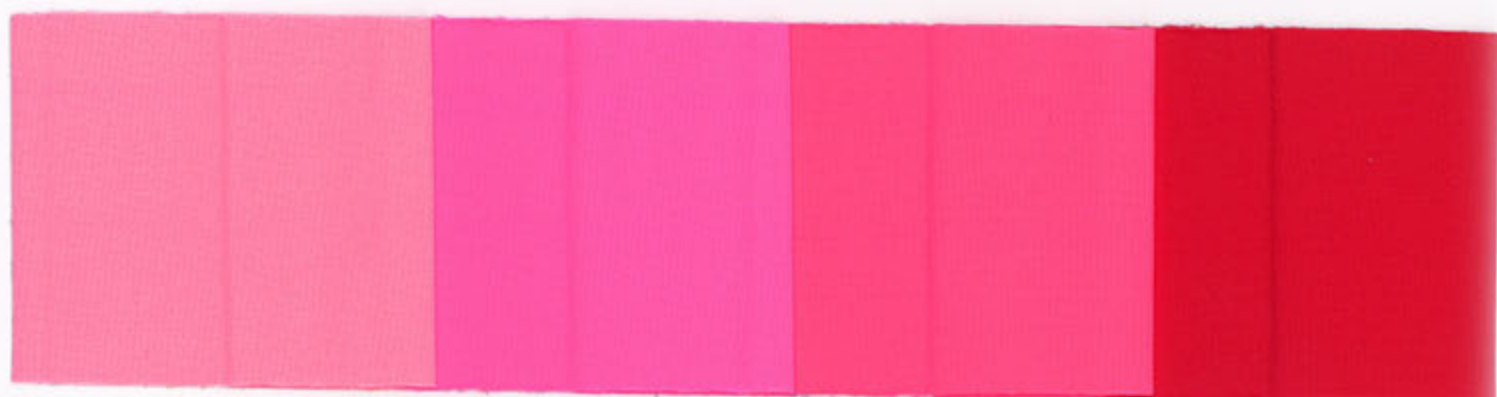
C 199 - SUNSET* Stock Service