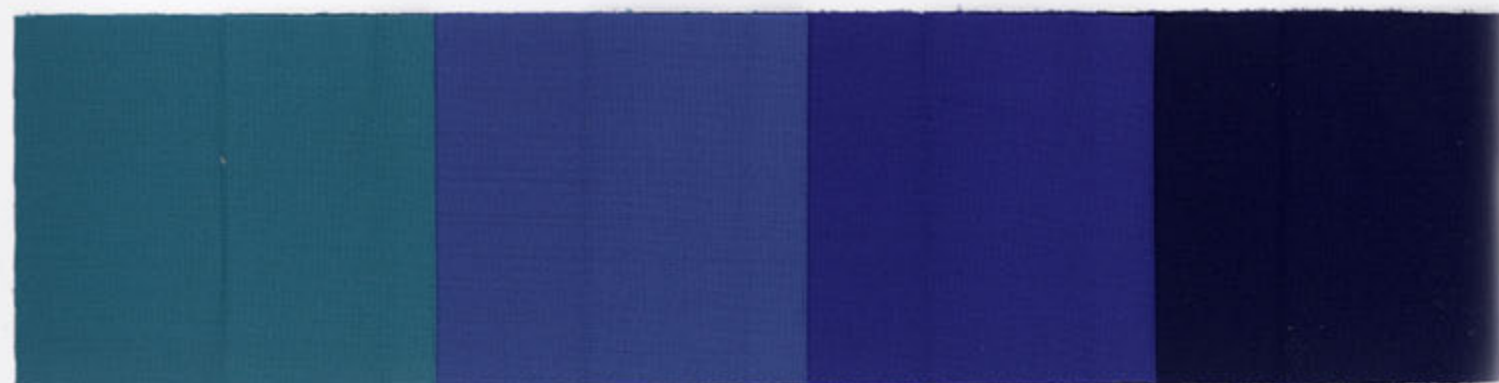
M 219 - TOURMALINE